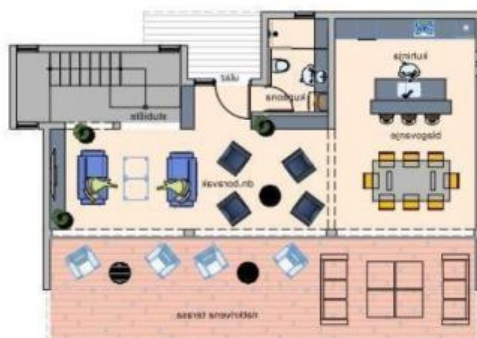
2. A - A i B 3. A - A i B