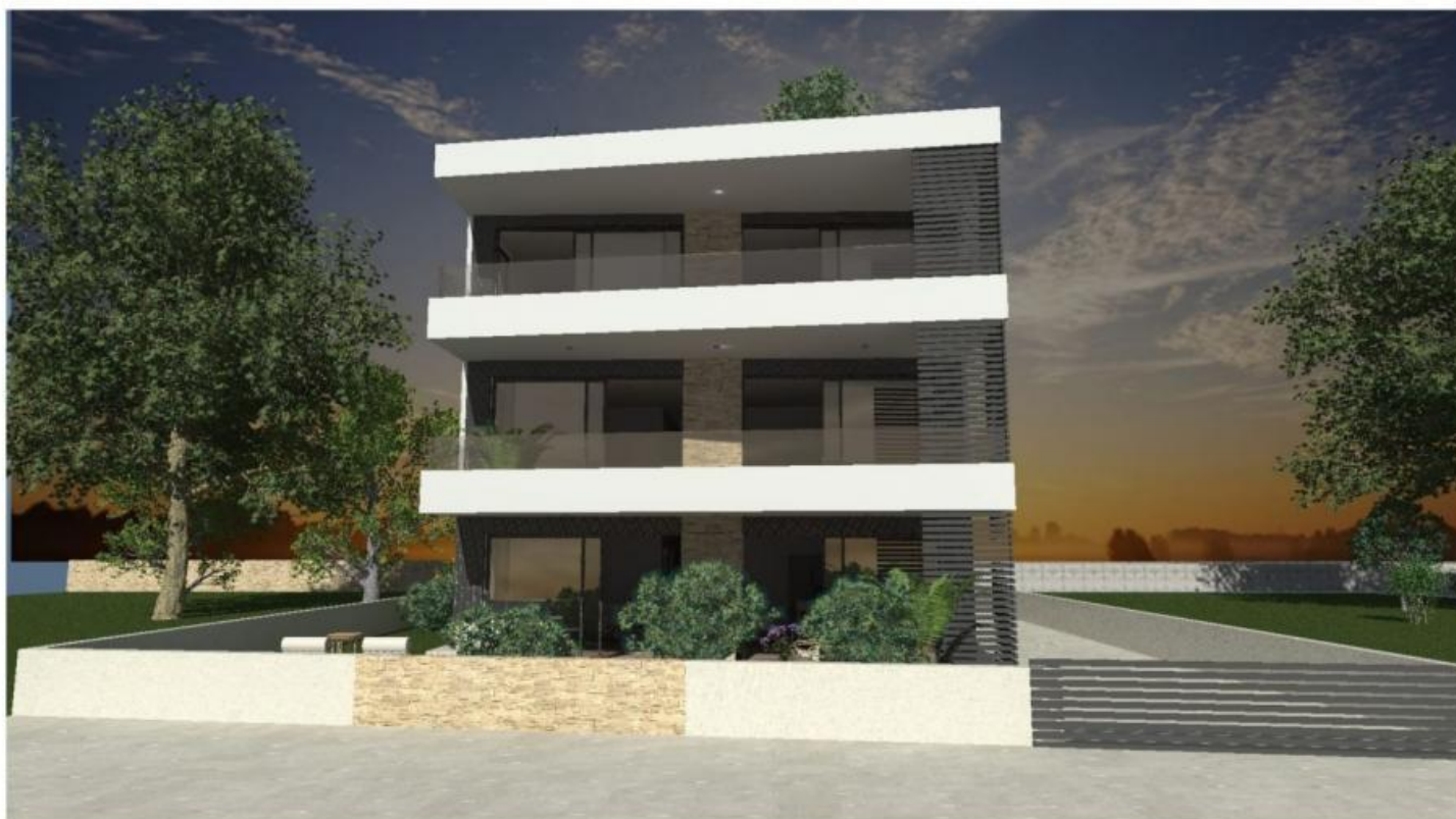
PRIZEMLJE VIZUALIZACIJA 1