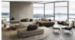
VILLA SOUTH | FIRST FLOOR