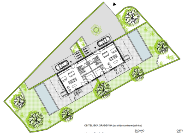
OBITELJSKA GRAĐEVINA (sa trije stambene jedinice)