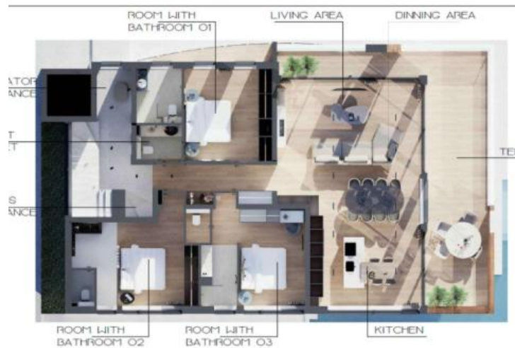
ROOM WITH BATHROOM 01, LIVING AREA, DINING AREA