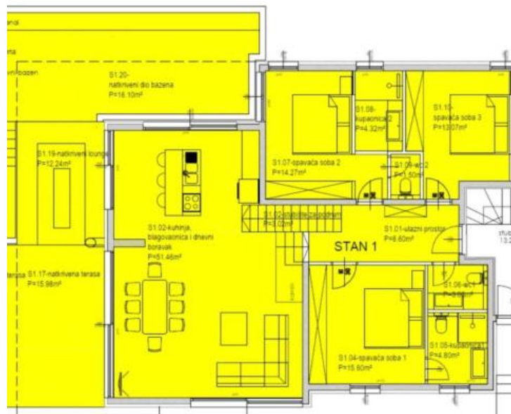
APARTMENT 02 FIRST FLOOR LAYOUT