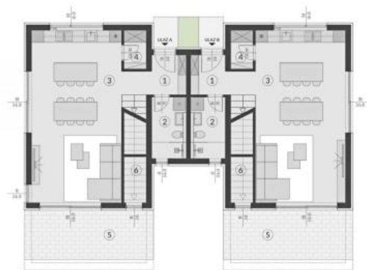
ISKAZ NETO PLOŠTINA "A"