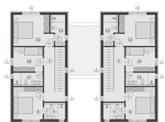
ISKAZ NETO PLOŠTINA "A"