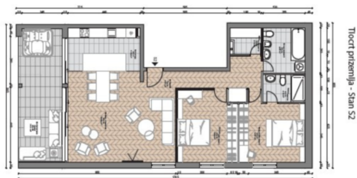
Pozicija na osnovi - Stan S2